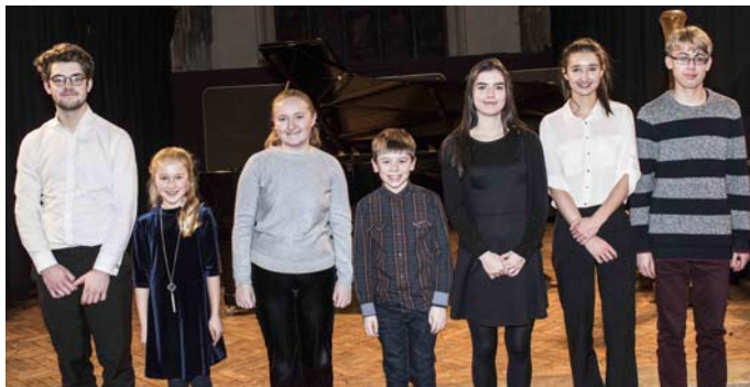
Last year's performers