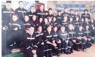
Down the Salt Mine!